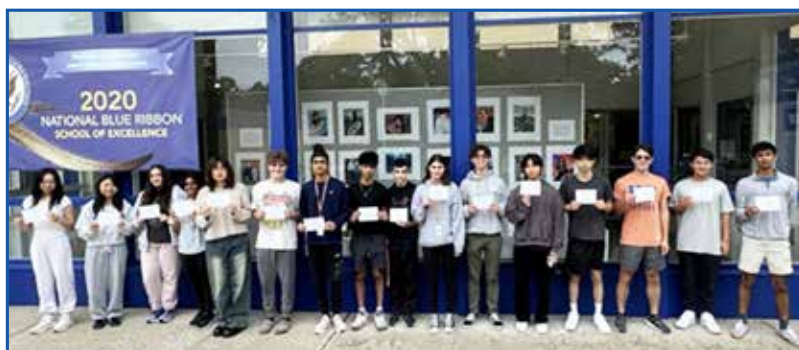
National Merit Commended Students

The District also congratulates the 20 students who have been named Commended Students in the 2025 National Merit Scholarship Program. These seniors are recognized for their academic promise as demonstrated by their outstanding performances on the 2023 PSAT.