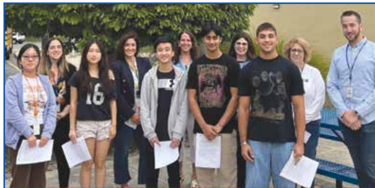
National Merit Semifinalists